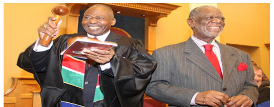
In 2015, Hon. Speaker Professor Katjavivi pledging to ensure that Namibian lawmakers did not become lawbreakers by not declaring their assets to Parliament. He was taking over from outgoing Speaker Theo-Ben Gurirab.

Peter Katjavivi is a prolific writer, having authored a number of publications, including A History of Resistance in Namibia (1988), Church and Liberation in Namibia (1989), and The Road to Namibian Independence (2003). He has himself been honoured with a number of awards, including ‘Ordre des Palmes Académiques’ (France, 1996); ‘Distinguished academic visitor award’ (New Delhi, India, 1998); ‘Honorary Doctorate of the University of Joensuu’ (Finland, 1999); ‘Certificate of Service to the Executive Council of the Association of African Universities’ (AAU, Accra), 2002; and ‘Most Brilliant Order of the Sun, First Class, Heroes Day’ (Namibia, 2014). Peter Katjavivi has comfortable command of less than five languages: German, English, French, Kiswahili and his native Otjiherero.